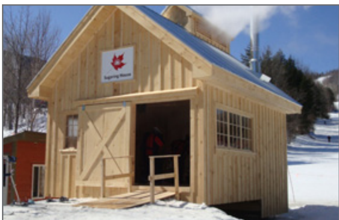
Sunday River has its very own Sugaring House and our syrup can be purchased at Sunday River Sports.