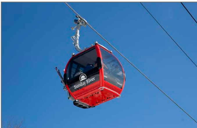
On December 20, 2008, Sunday River opened the first Chondola in the northeast U.S. – carrying six-person chairs and eight-person gondola cars on one high-speed lift.