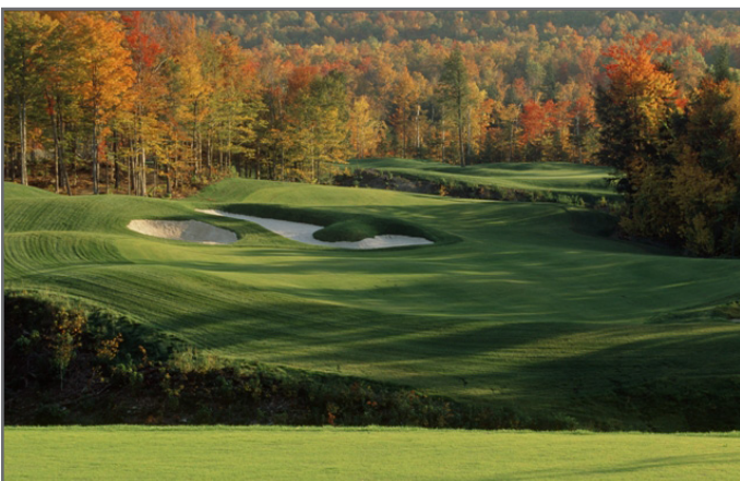
The Sunday River Golf Course has been named "#1 Course in Maine" by Golfweek.