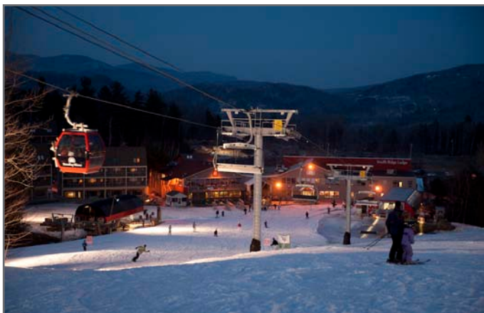
Sunday River has 12-hour skiing and riding on weekends and most holidays.